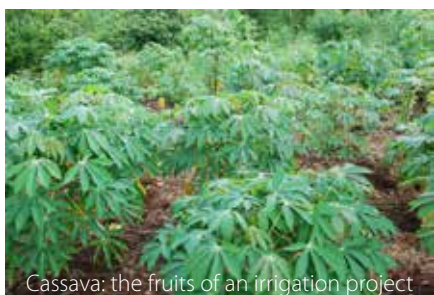
Cassava: the fruits of an irrigation project

very visible on the island. In Stone Town in particular, our two cathedrals stand out, with their sought-after schools, one primary, one secondary. But the Anglican Christ Church Cathedral occupies a site that is unique - that of the former slave market. Its appalling underground lock-up survives in the compound and the High Altar stands where the whipping post once stood: what better way of bearing witness to that awful history?